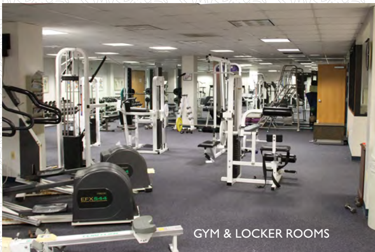
GYM & LOCKER ROOMS