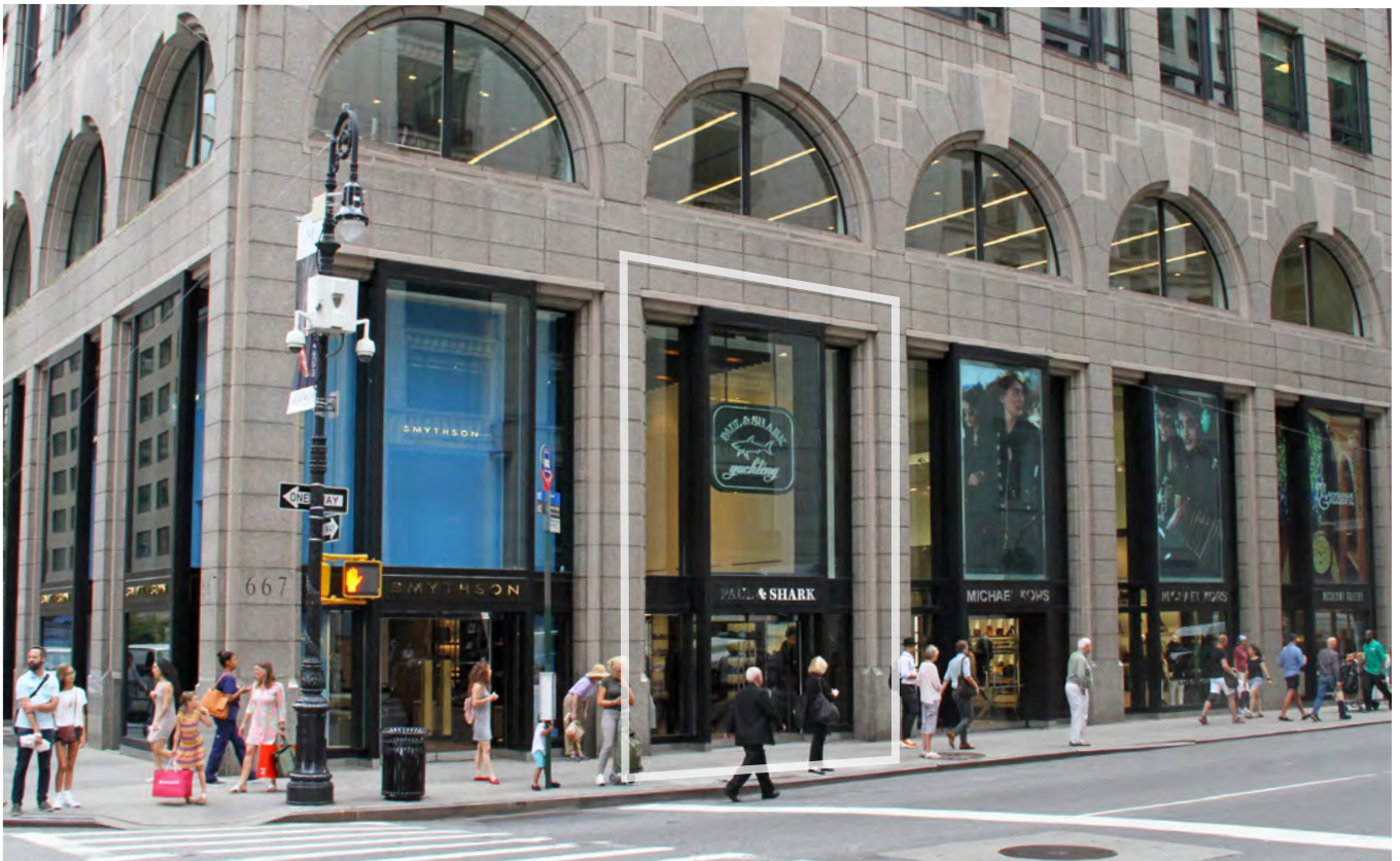
667 Madison Avenue and 61st Street