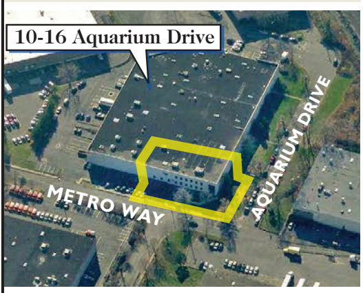
For leasing information, please contact:

• Many bus lines service Harmon Cove from New York's Port Authority and various parts of New Jersey. Train service is available to the entire Metro Region at nearby Secaucus Junction Train Station.