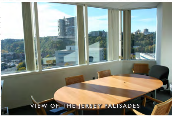
VIEW OF THE JERSEY PALISADES