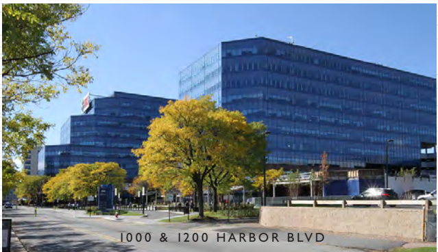
1000 & 1200 HARBOR BLVD