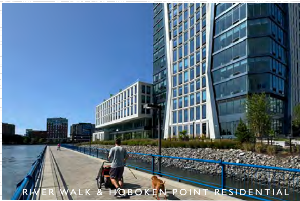
RIVER WALK & HOBOKEN POINT RESIDENTIAL