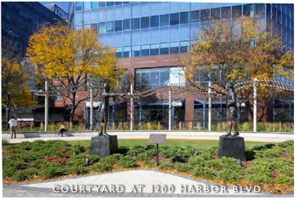
COURTYARD AT 1200 HARBOR BLVD